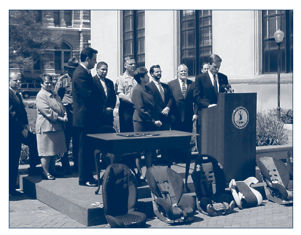
Governor Mark Warner signs the booster seat law on April 4, 2002 at the State Capitol.