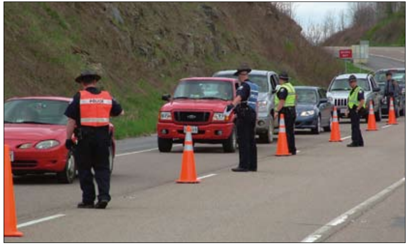
LEFT: A Coeburn Police Officer gives a motorist a "Buckle Up Award" and a coupon for free pizza for obeying the law and buckling up during the "Operation 58" checkpoint. RIGHT: Officers from law enforcement agencies throughout Wise County conduct the "Operation 58" checkpoint.