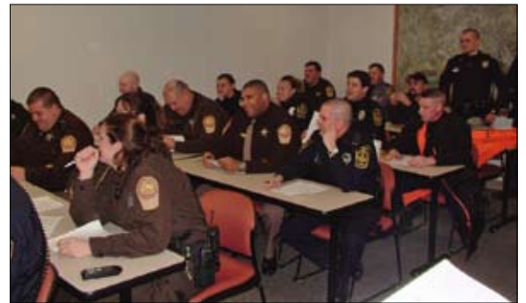
BELOW: Officers assigned to the checkpoints are instructed on the operation plans and checkpoint site responsibilities.