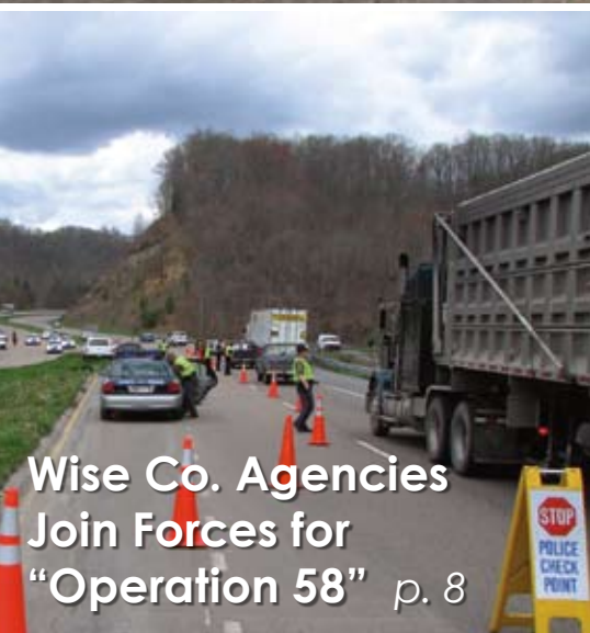
Wise Co. Agencies Join Forces for "Operation 58" p. 8