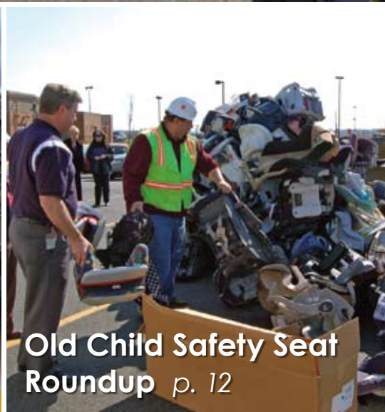
Old Child Safety Seat Roundup p. 12