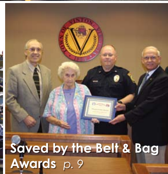
Saved by the Belt & Bag Awards p. 9