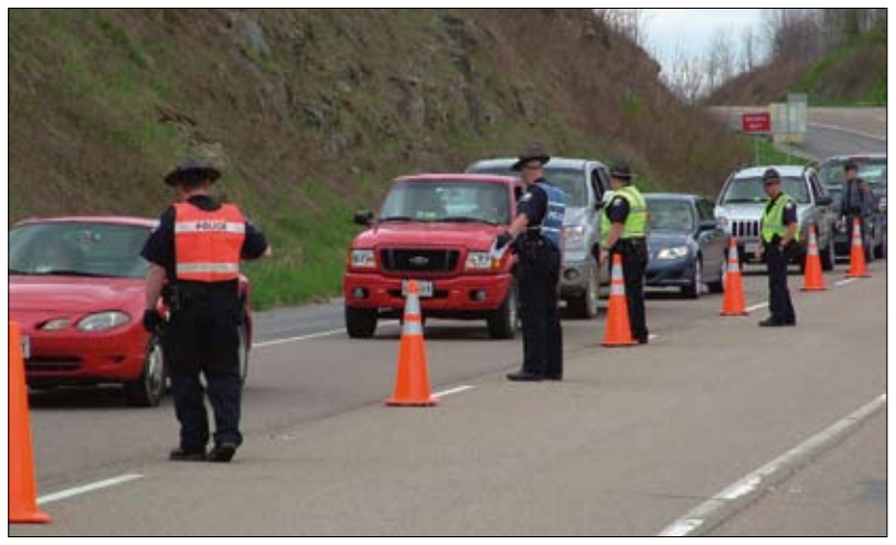
LEFT: A Coeburn Police Officer gives a motorist a "Buckle Up Award" and a coupon for free pizza for obeying the law and buckling up during the "Operation 58" checkpoint. RIGHT: Officers from law enforcement agencies throughout Wise County conduct the "Operation 58" checkpoint.